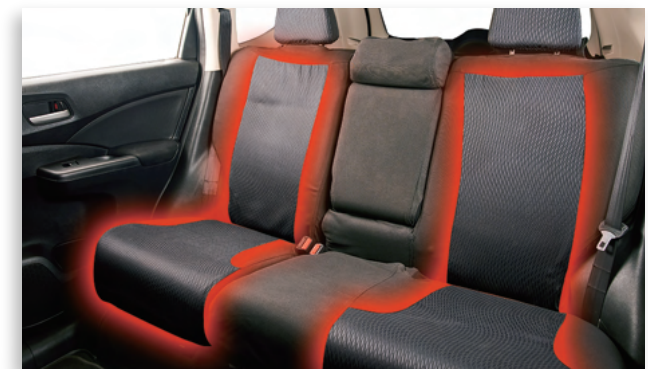
< Application >